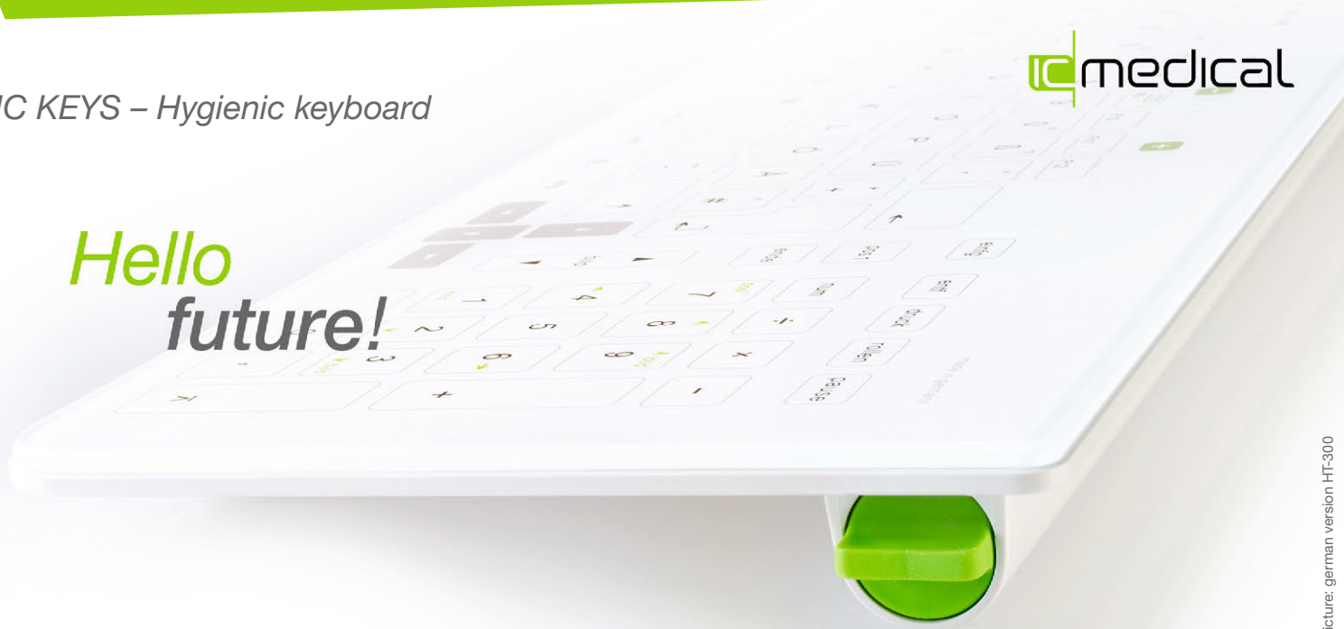
Picture: german version HT-300